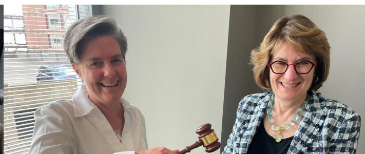
Congrats to our ACE Award Winners