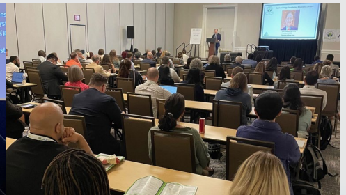
Tom Frieden, MD, MPH Endowed Lecture Reception.