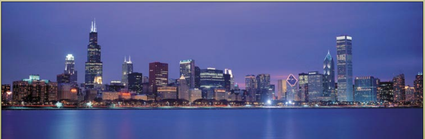
Chicago skyline, Vito Palmisano