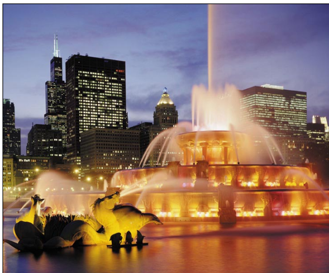
Buckingham Fountain