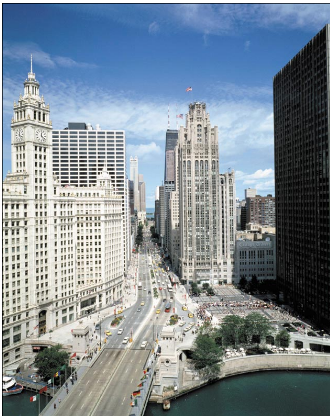
Michigan Avenue

Submit your abstract by July 31 to info@acepidemiology.org .