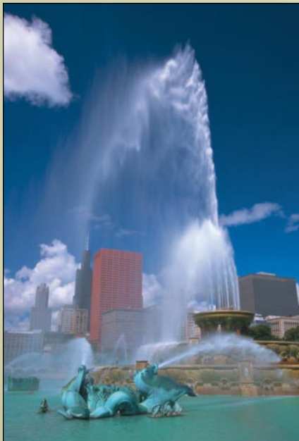
Buckingham Fountain, Vito Palmisano