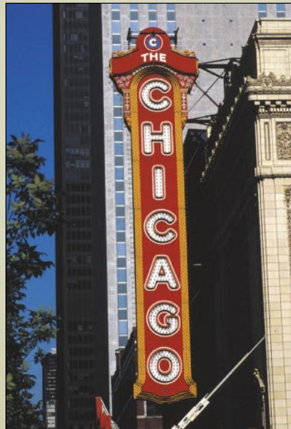
Chicago Theatre, Cheryl Tadin